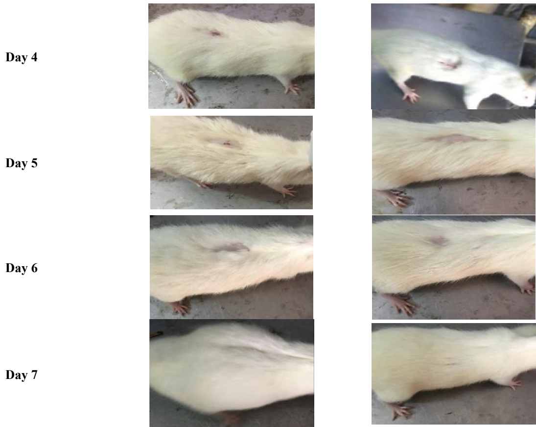
Fig-1:Comparitive Analysis between Aloe Vera and Mycitracin.