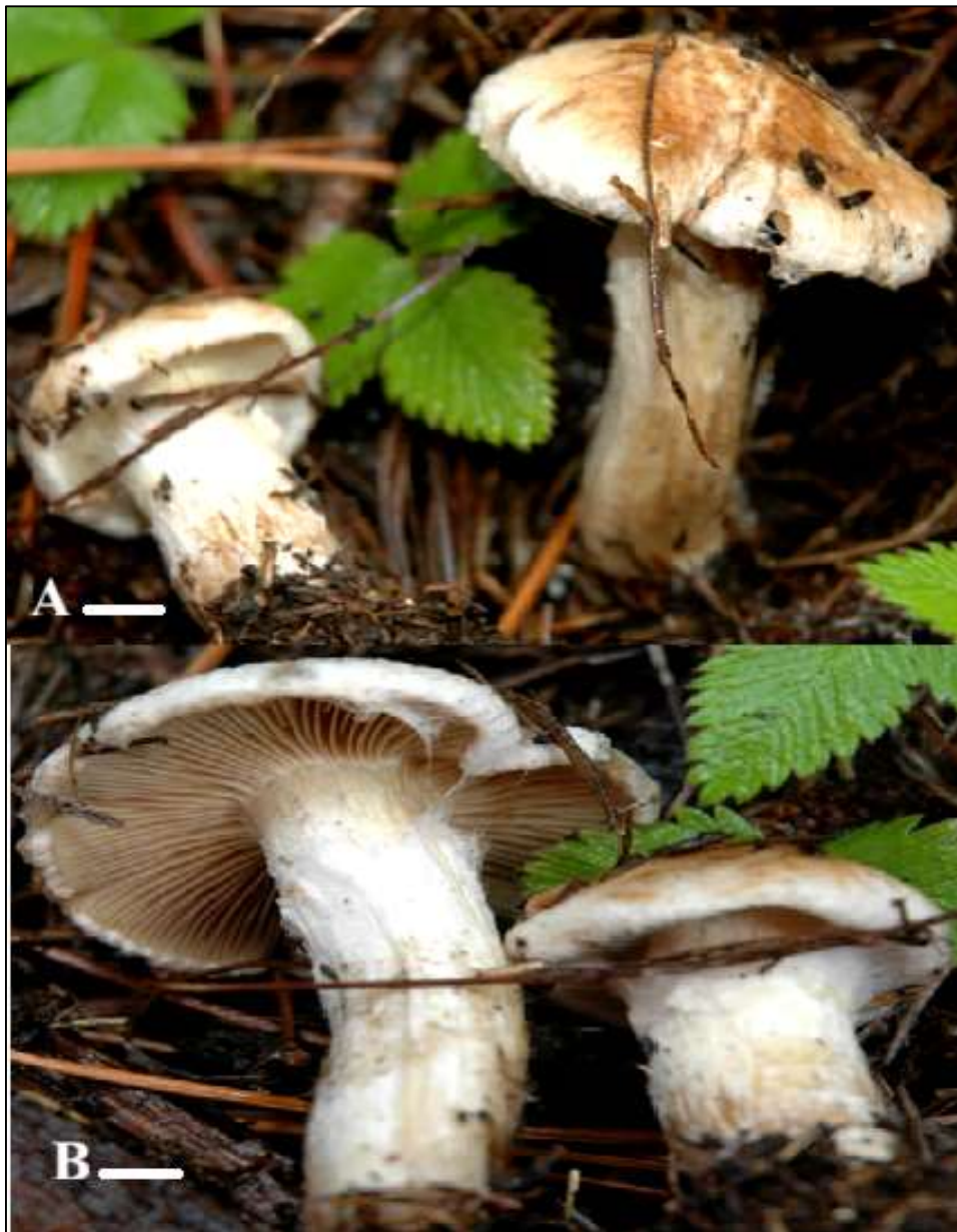
Fig. 1. Morphological features of Mallocybe gilgitica . (a) Basidiocarps showing pileus surface and stipe. (b) Basidiocarp showing hymenium with stipe. Scale bars: (a, b) = 1 cm.

Known Distribution. To date, M. gilgitica is endemic to the western Himalayan range in northern Pakistan, specifically from Fairy Meadows in Gilgit-Baltistan. The species was found growing scattered on humus-rich soil in subalpine coniferous forests dominated by P. wallichiana .