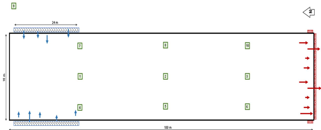
Figure 1. Location of data loggers in the poultry house

The study was conducted for 42 days during the summer period, covering the months of July and August in a commercial broiler production facility located in Kahramanmaraş Province. Temperature and relative humidity were measured at 9 different points. All data loggers in the interior environment were positioned 0.3 m above the ground, taking into account the body height of the animals, to best represent the actual environmental conditions they experience (Ferreira et al. , 2024). The measurement setup layout is given in Figure 1.