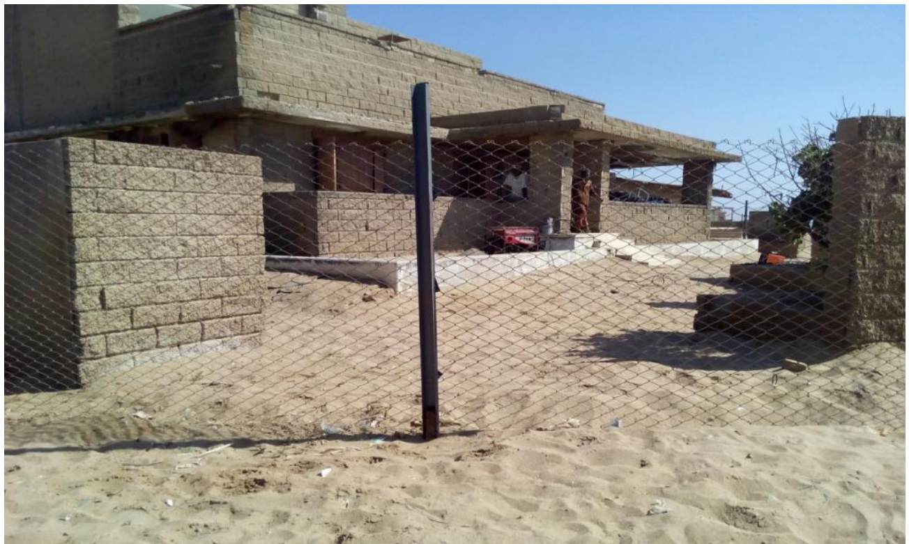
Fig.11.Fencing around hut, a threat to female turtle.