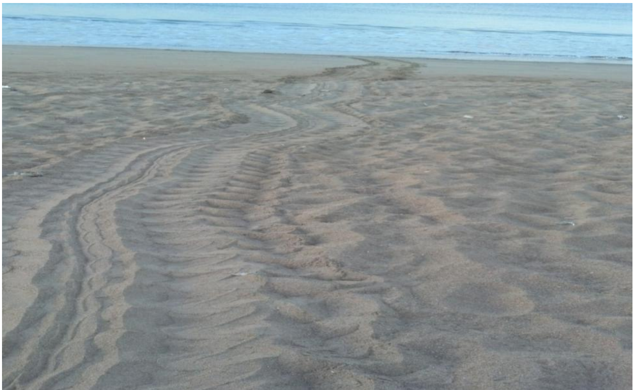
Fig.5.Green turtle track atSandspit.