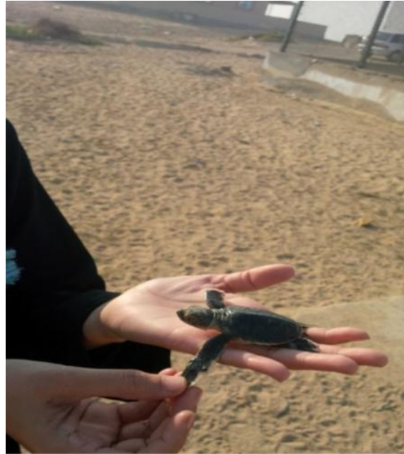
Fig.7. Hatchling collected from hatchery.