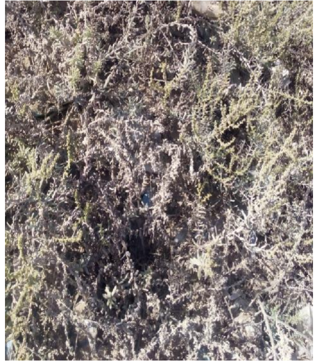
Fig. 3. Potential habitat of lizards at Sandspit.