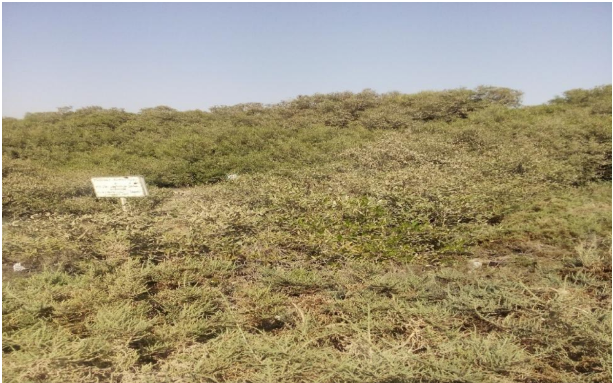
Fig.13. Mangrove Forests at the coastal areas of Karachi.