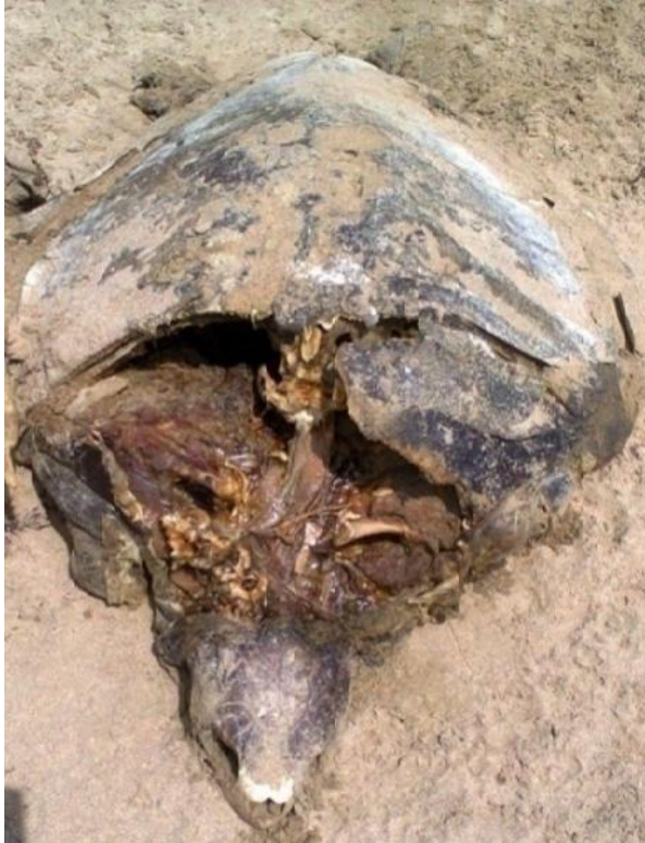
Fig.9.Green turtle killed by fishing activity.