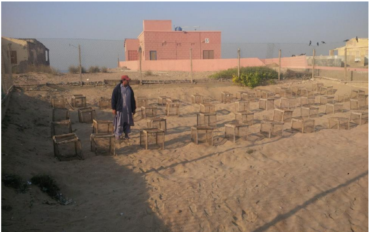
Fig. 8. Marine Turtle hatchery at Hawkesbay.