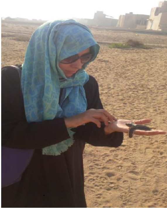
Fig. 6. Green turtle hatchling.