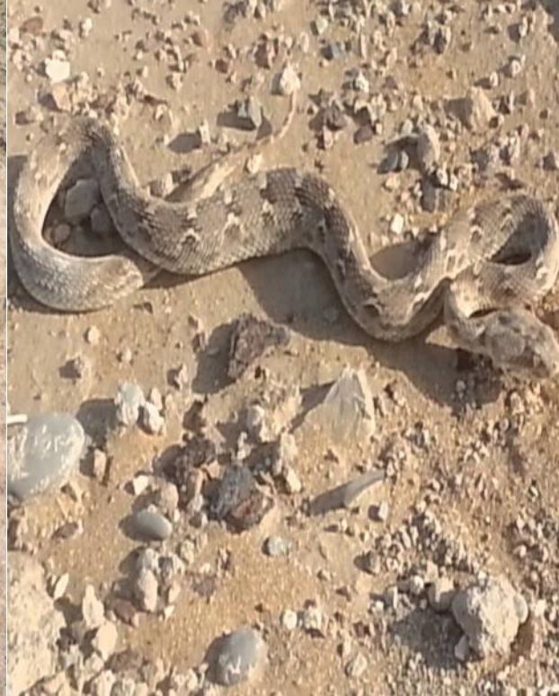
Fig.10. Saw scaled viper.