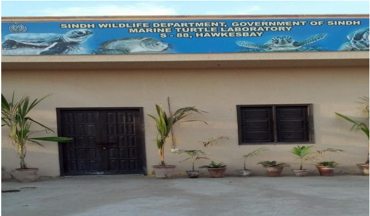
Fig.12. Marine Turtle Laboratory atHawkesbay.