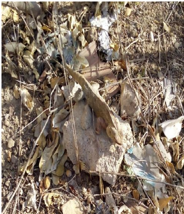
Fig. 2. Common tree lizard.