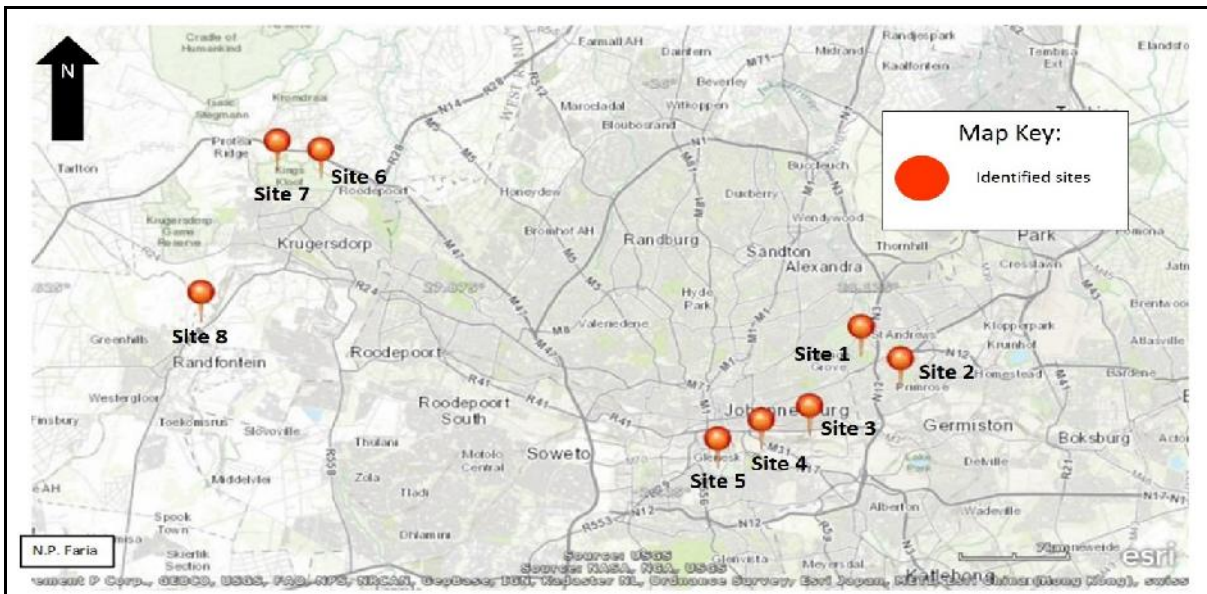
Figure 2. Eight possible sites of occupation of C. aureus according to altitude and aspect (Esri 2016).