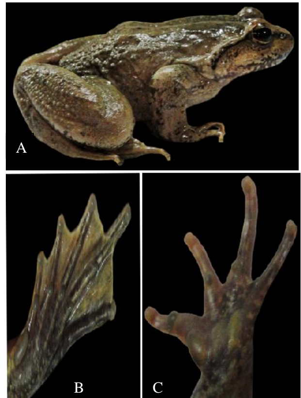
Fig. 3. Rais 052.12 A. Nanorana vicina , male; B. Hand; C. Foot.