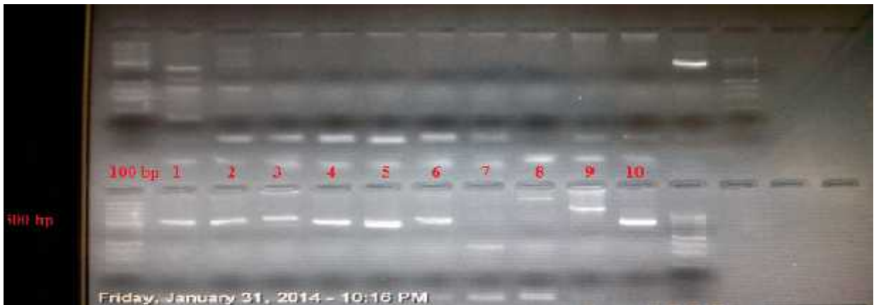
Figure 1. Agarose gel electrophoresis of coa gene PCR amplification products. 100 bp DNA ladder, lane 1-2: 540 bp, lane 3,6: 550 bp, lane 4-5,10: 525 bp, lane 7: 430 bp and lane 9: 840.

from the world has been shown in table 1. All the Pakistani strains of coagulase gene were 99.98-100% similar while their divergence was 0.02%. The Japanizes strains were close to Pakistan strains and their similarity and divergence was 99.97% and 0.03%, respectively. The Pakistani strains were 99.93% similar and 0.07% divergent from Indian and German strains. Similarly, the Pakistani strains were 99.94% similar and 0.06% were divergent from UK and Taiwan reported strains.