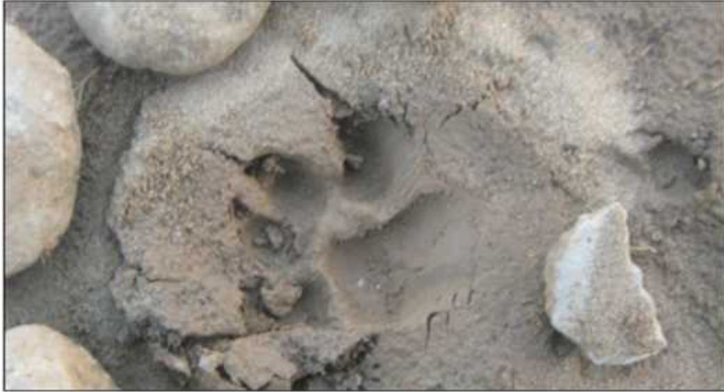
Figure 2. Pug mark of grey wolf in Burden village