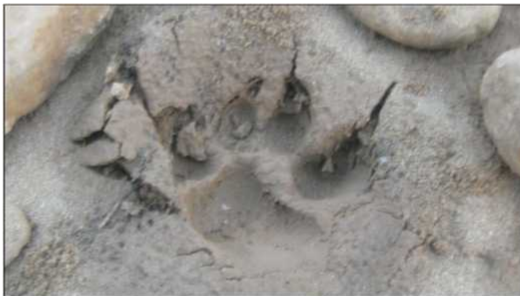
Figure 1. Pug marks of grey wolf in Lehri village

Threats: The major threats to grey wolf and Asiatic jackal population in the Lehri Nature Park included loss of habitat, biotic pressure by human i.e. grazing, fuel wood collection and human- wolf conflict due to depredation on their livestock. The part of the potential habitat of grey wolf and Asiatic jackals was disturbed by military exercises i.e. firing which has resulted in shifting of many wildlife species particularly Punjab Urial from the study area. Presently, wolf mainly relies on goats and sheep for food. However, wolves face more persecution from local shepherds as compared to nomadic shepherds. The grey wolf was persecuted by shooting, smoking in their dens and digging out dens to kill the pups (Jhala, 2003).