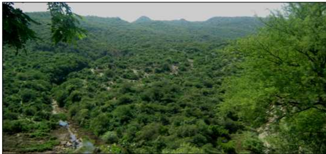
Fig 3 (a and b). Potential habitat of Grey wolf in north of the study area near Mangla dam.