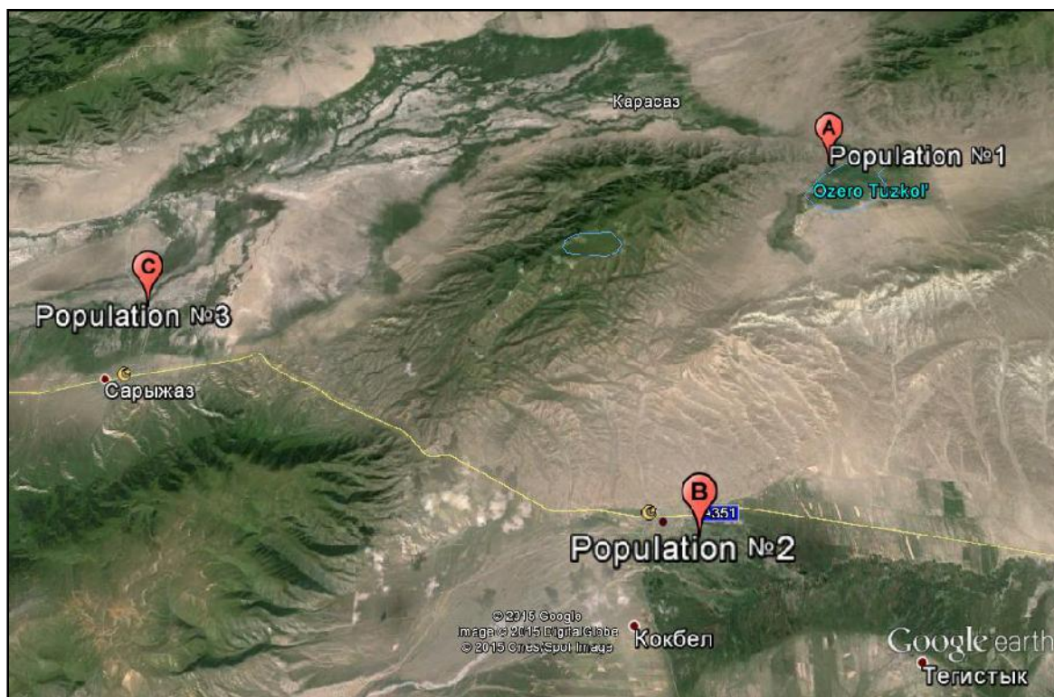
Figure 1. Location map for the three studied populations of Taraxacum kok-saghyz

A total of three populations of Taraxacum kok-saghyz L.E. Rodin were recorded from the Almaty region of Kazakhstan (Fig. 1).