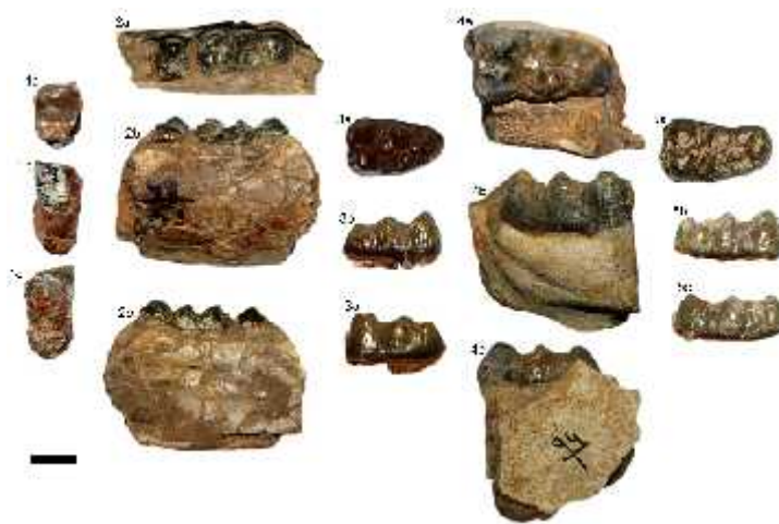
Fig3. Conhyussindiensis . 1. PUPC 08/93, an isolated lower first molar;2.PUPC 99/51, mandible having M_{2-3} ; 3.PUPC 94/64,an isolated lower third molar;4.PUPC 94/1, an isolated lower third molar;5. PUPC 94/7, an isolated lower third molar.a. occlusal view b. buccal view c. lingual view. Scale bar 10mm.