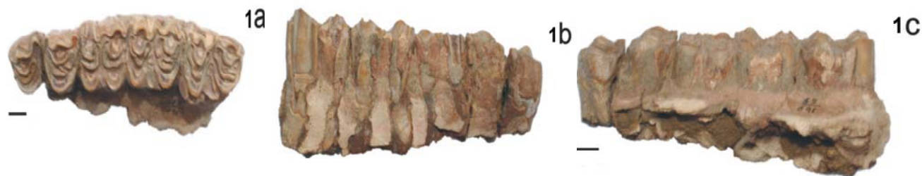
FIG. 2. – Proamphibos sp.: 1. PUPC 69/641. a = Crown view, b = buccal view, c = lingual view. Scale bar 10 mm.

Broad upper molars are the characteristic of Bovinae and Boselaphinae than the other subfamilies of Bovidae. But in Bovini teeth are extremely hypsodont, accompanied by the formation of cement, the disappearance of the wrinkles on the enamel and the enlargement of the basal pillars on the inner and outer sides respectively of the upper and lower molars (Pilgrim, 1939). Excessive anterior – posterior compression of Bovini molars has produced median ribs of extraordinary strength. This type of development has taken place also in Bopselaphini genera Selenoportax and Pachyportax .