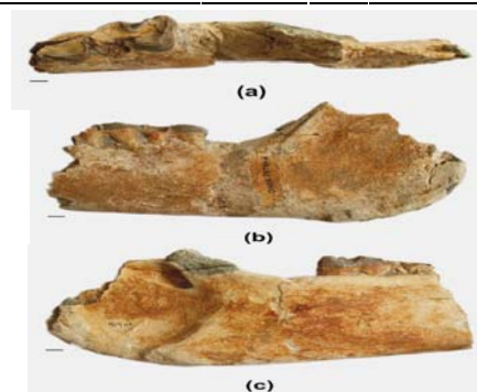
Fig. 1: Chilotherium intermedium , PUPC 84/106, a left mandibular ramus with the last molar, (a) Occlusal view, (b) Lingual view and (c) Buccal view. Scale bar 10 mm.